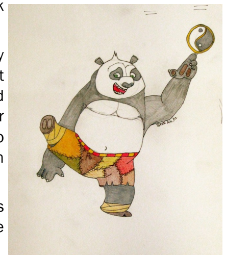
Art Work by Jose Angel Olivares

We can not teach people anything, we can only help them discover it within themselves. ~ Galileo