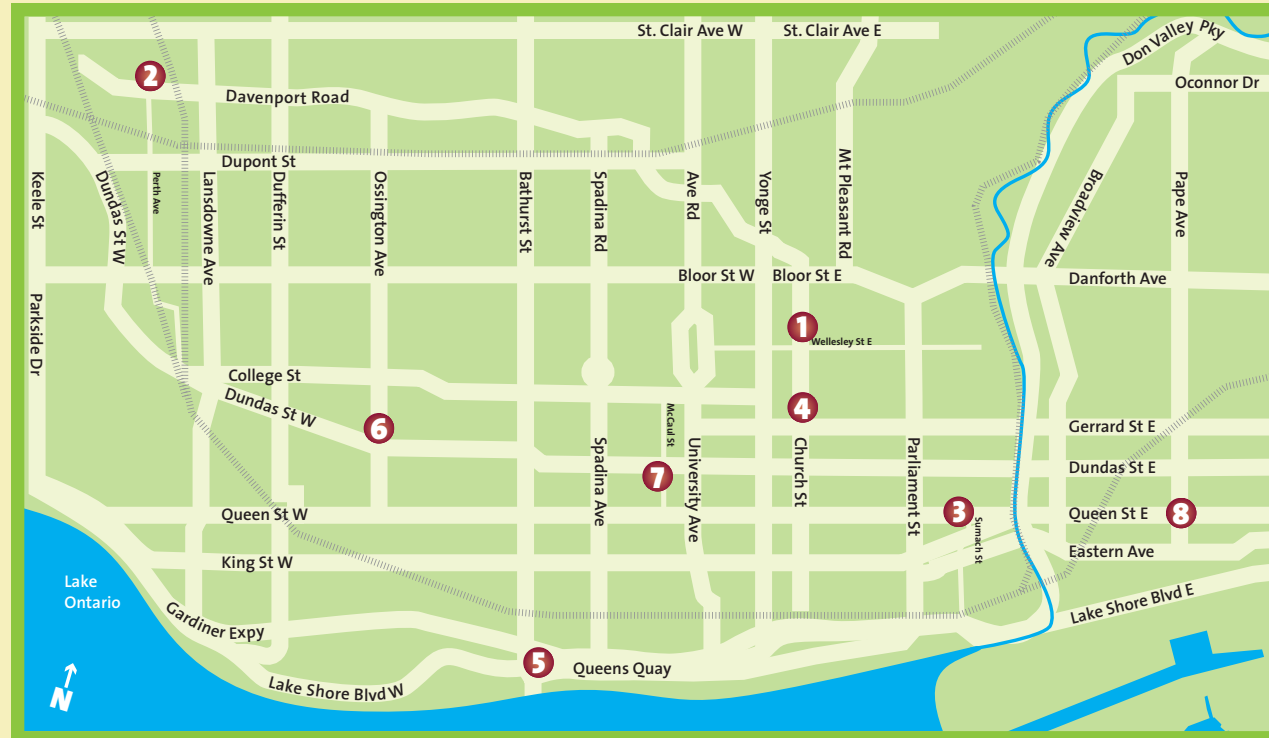
Design: Victor Szeto